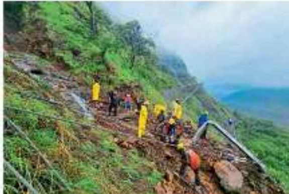
मुंबई : कर्जत-लोणावळा घाट परिसरात रॉकफॉल वीरयथमध्ये अडकलेले टाउंड आणि माती काढण्याचे काम मजूर करत आहेत.