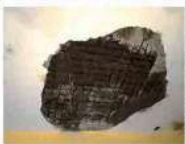
खारघर : रेल्वे स्थानकातील स्लॅबचे प्लास्टर कोसळून कर्मचारी जखमी झाला.

खारघर (बातमीदार) : खारघर रेल्वे स्थानकावर कर्तव्यावर असलेल्या रेल्वेच्या एका कंत्राटी कामगाराच्या डोक्यावर स्लॅबचे प्लास्टर कोसळल्याने