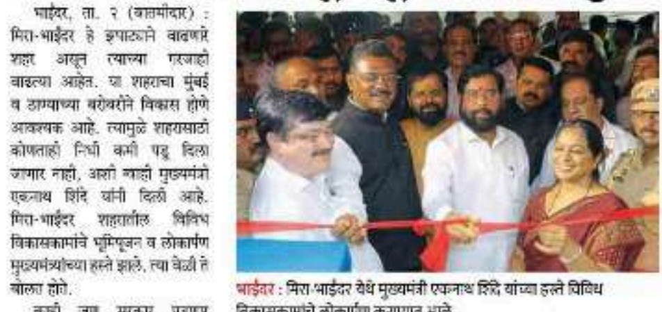
भाईदर : मिरा-भाईदर येथे भूमिपूजन एकनाथ शिंदे यांच्या हस्ते पवित्र विकासाकामांचे लोकार्पण करण्यात आले.